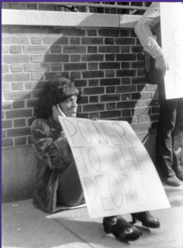
Marsha P. Johnson at Gay Liberation Front's Demonstration at Bellevue Hospital, 1970